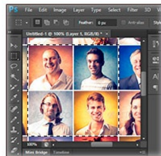
works in Chrome in Firefox