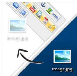
works in all major browsers

3 Paste selections from your favorite editor