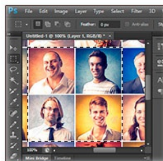
works in Chrome in Firefox